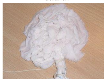
scrunch pattern ready to dye